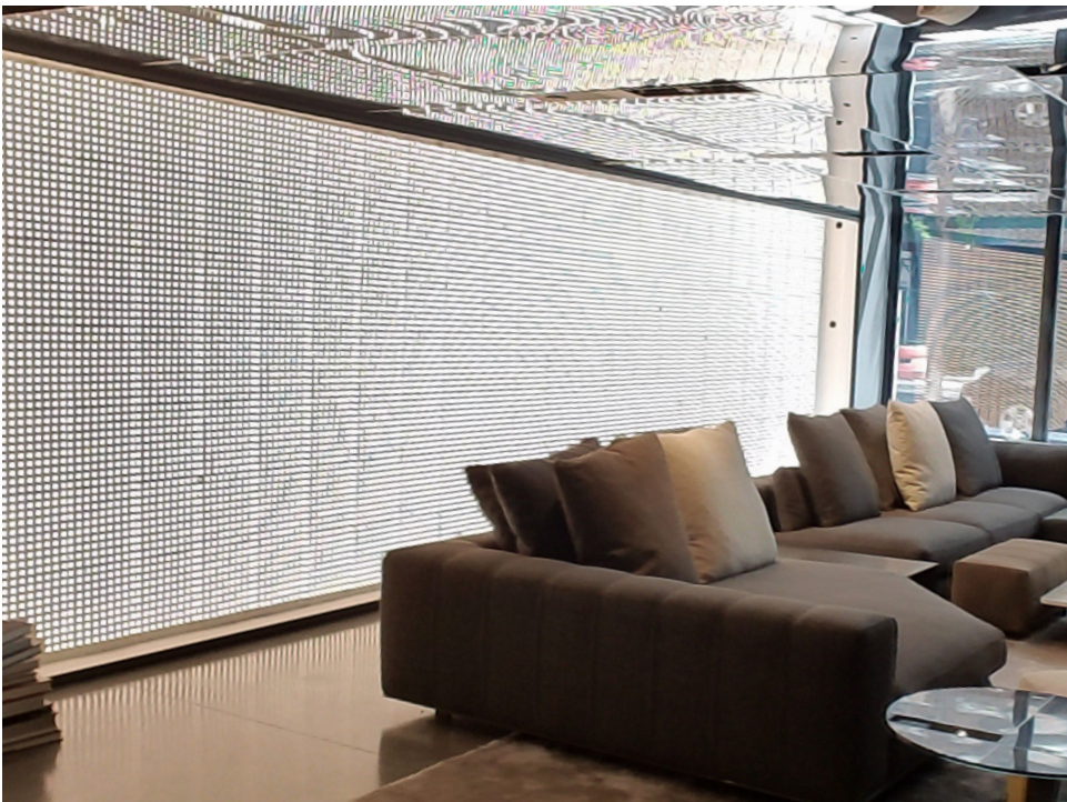
Cooledge TILE Interior

Standard light output (300lm) TILES were chosen for the continuous feature wall to act as a supplement to the daylight provided by the floor-to-ceiling windows in the street level area of the showroom.