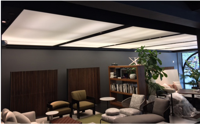
Original Fluorescent Lamps – Luminous Ceiling

A segmented stretch ceiling and matching continuous luminous feature wall are used to create a well lit but comfortable environment to complement the stylish furniture on display. However, the shadows and hot spots created by the fluorescent lamps initially installed detracted from the clean, uniform aesthetic that makes luminous surfaces such a powerful design tool.