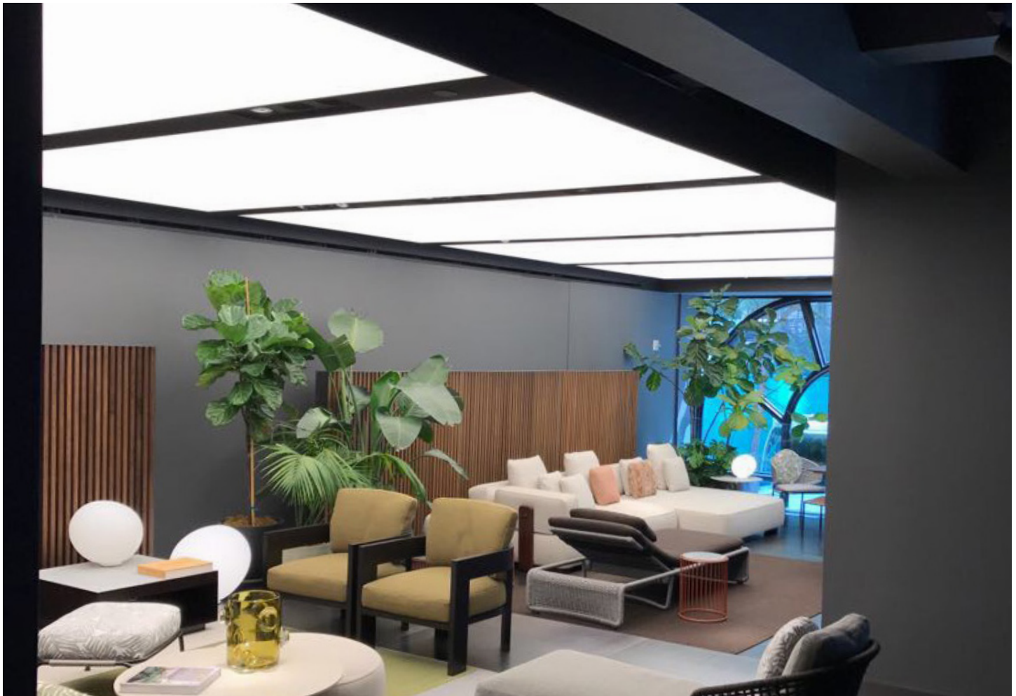
Interior Light Levels