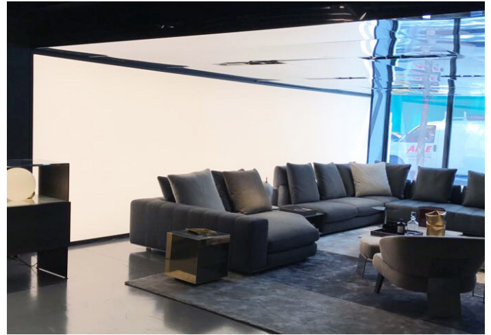
Luminous Feature Wall with Cooledge TILE Interior

“I personally think it was a very easy transition from fluorescent bulb to Cooledge TILE. It is a cleaner look and was fast and efficient to install. It makes the space look better as you see in the pictures of before and after.”