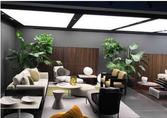
Luminous Ceiling with Cooledge TILE Interior