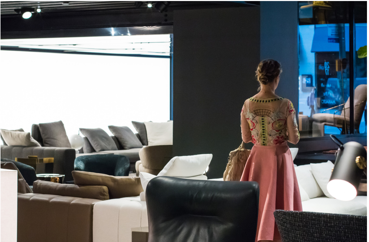
Cooledge TILE Interior is used to Supplement Daylight at Street Level