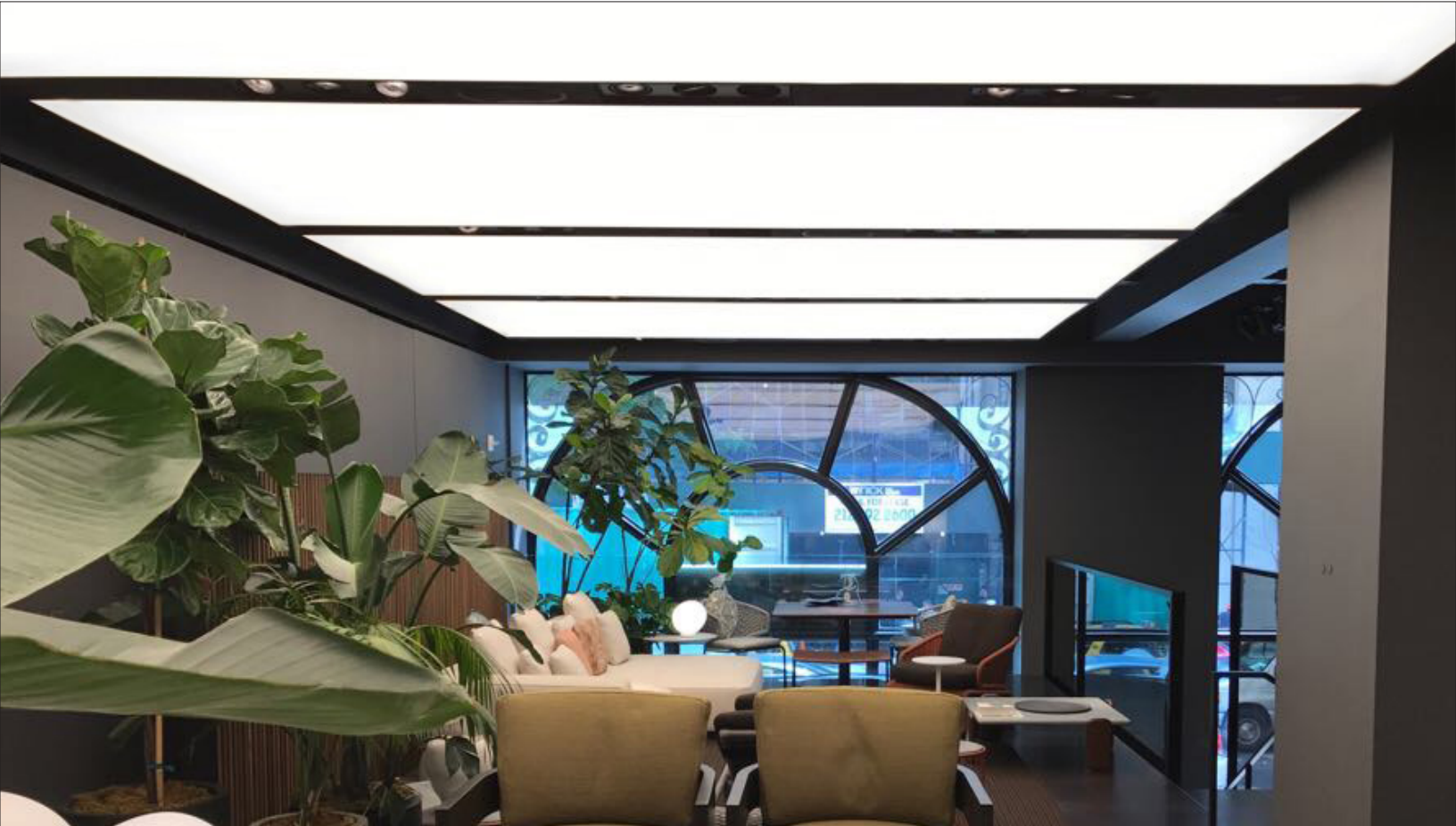
Segmented Luminous Ceiling

New York, NY Designer Furniture Showroom