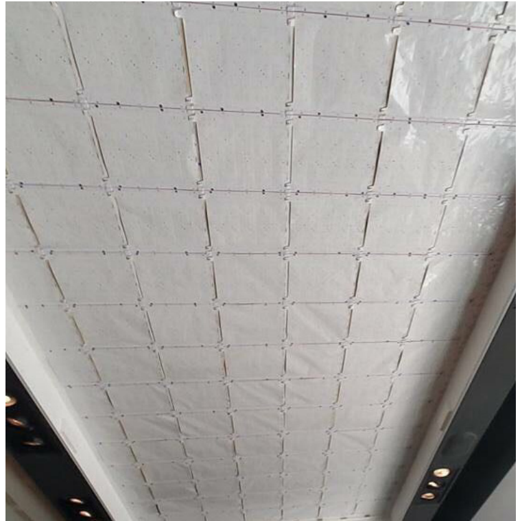
Cooledge TILE Interior